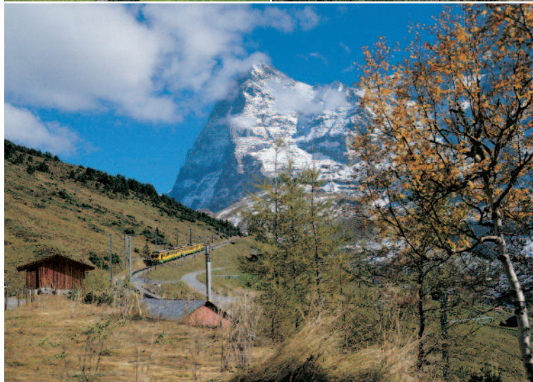
Eiger North Wall in background, hiking trail to right of track