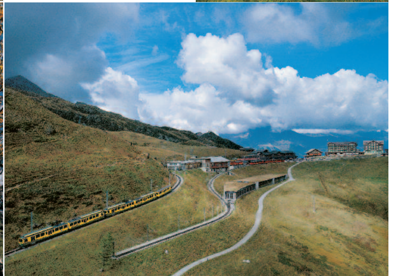
Kleine Scheidegg Alpine station